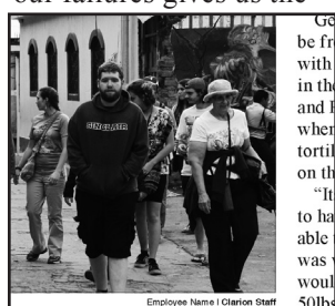
Employee Name | Clarion Staff

at all perfect, but the goal of working at The Clarion is gaining experience to further our degree. Our mistakes give us the opportunity to self reflect. How we handle our mistakes and 'bumps in the road' give us the opportunity to learn how to handle adversity. Embracing our failures gives us the