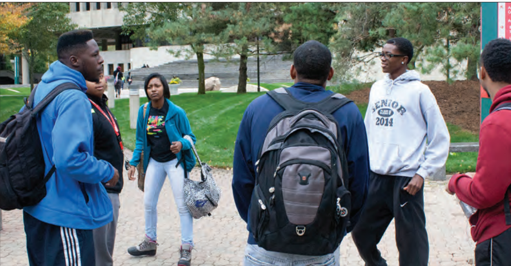
Deja Goode | Clarion Staff