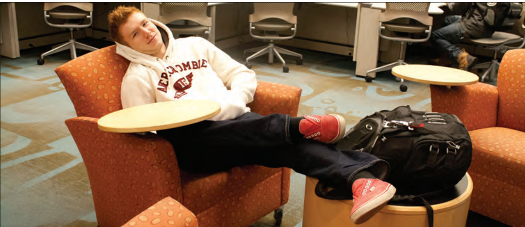
Deja Goode | Clarion Staff