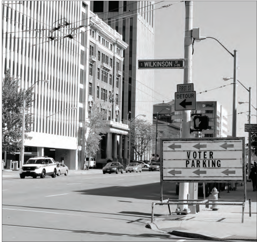
The elderly are expected to come out in high numbers during this election season.