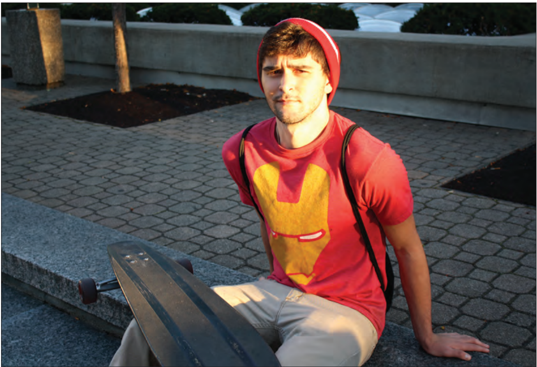
Deja Goode | Clarion Staff