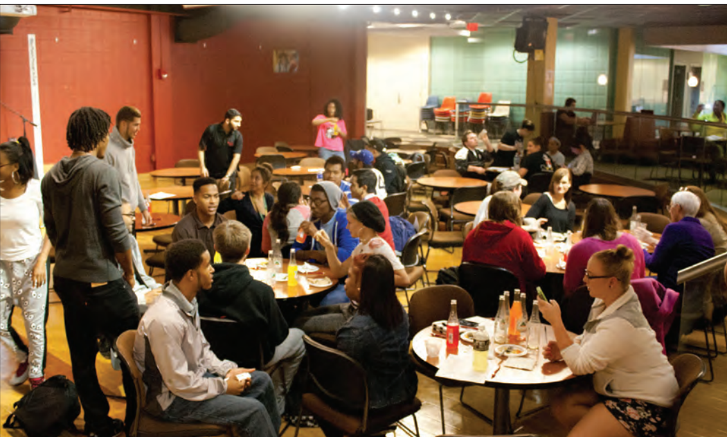
Deja Goode | Clarion Staff