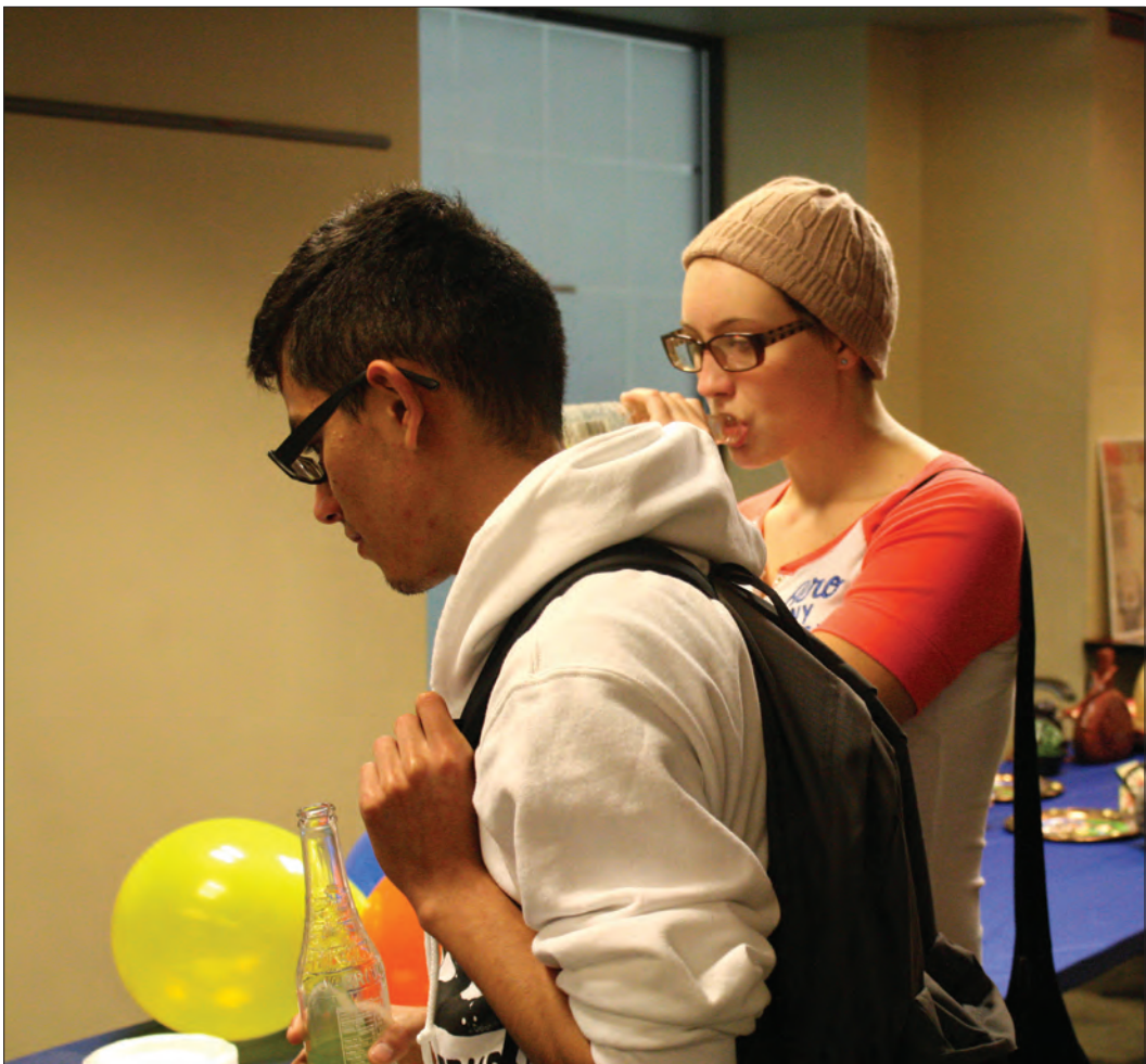
Deja Goode | Clarion Staff