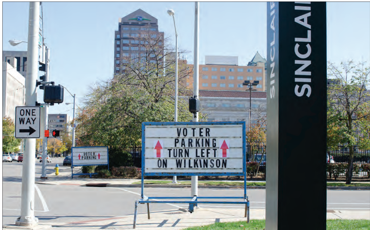
Signs are displayed throughout downtown Dayton to help lead voters to the available parking.