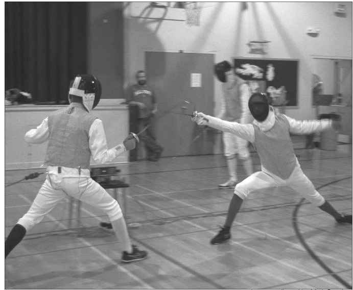
Students practicing fencing at Sinclair.

Tuesdays and Thursdays this quarter was canceled due to lack of enrollment.