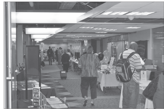
Stan Pearson II demonstrates S.A.L.S.A. to students and encourages them to overcome obstacles and find success in their own lives.

students learn to be comfortable in their own skin.