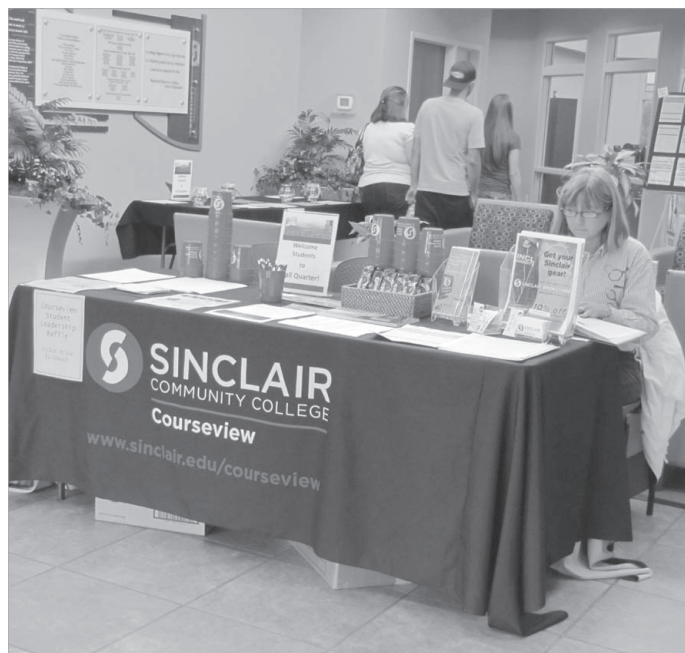
A Courseview rep. hands out information at Sinclair's main campus

"We don't have a deadline but we are working on it to make it happen. In the near future we will have new facilities," Sehi said. "We are offering classes at King's High school in order to be able to