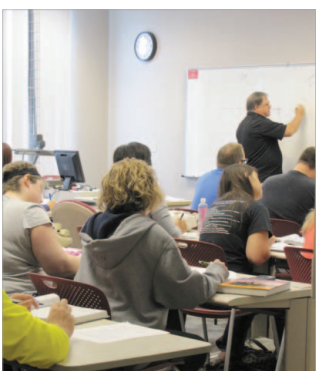
The campus now offers more degree programs for students.