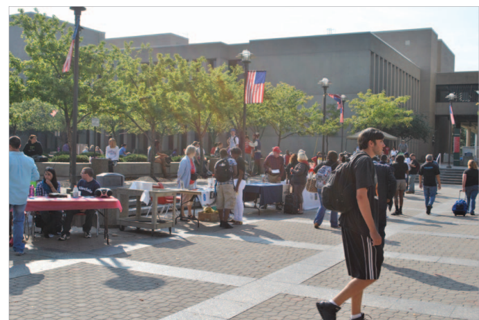
Students gather at the quad for Welcome Week. The event had informational tables, free food and prizes.